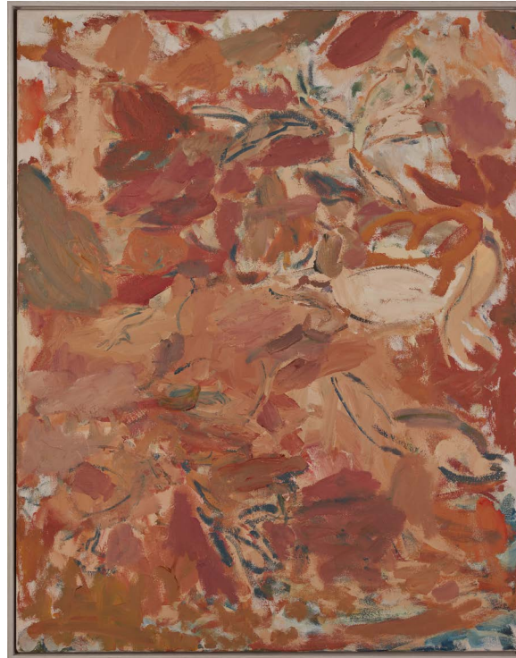
I know my way from here