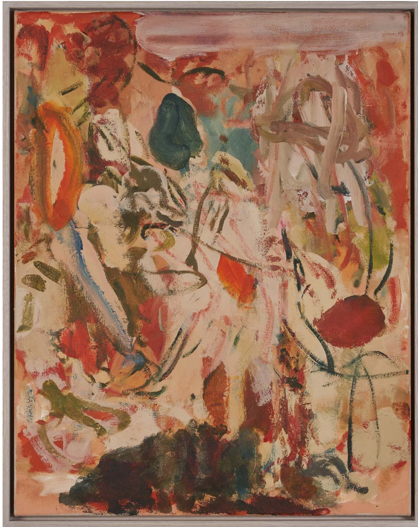
Seeing is believing