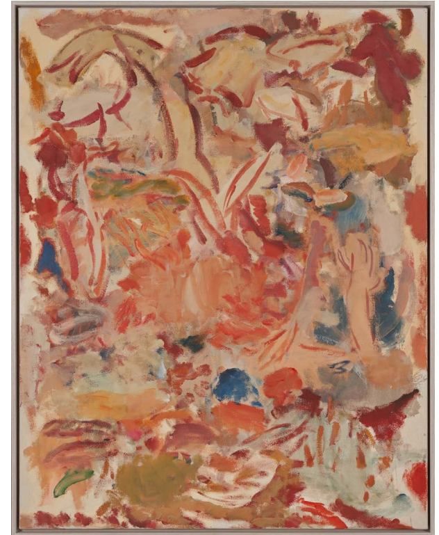
Tree amongst shrubs - survival