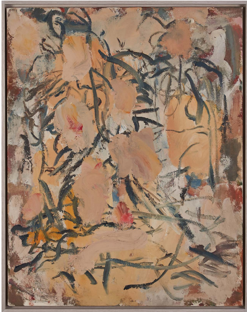
The sweet sense of relief