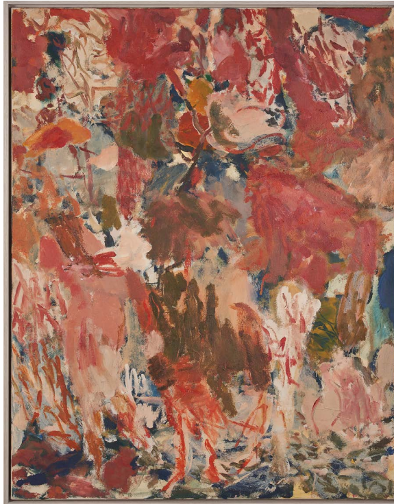
Did you find what you are looking for

Acrylic and pastel on canvas 90 x 115cm £3,950