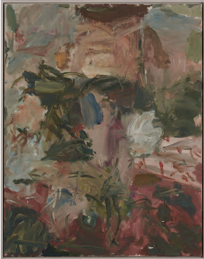
Amongst the trees, inside my dreams