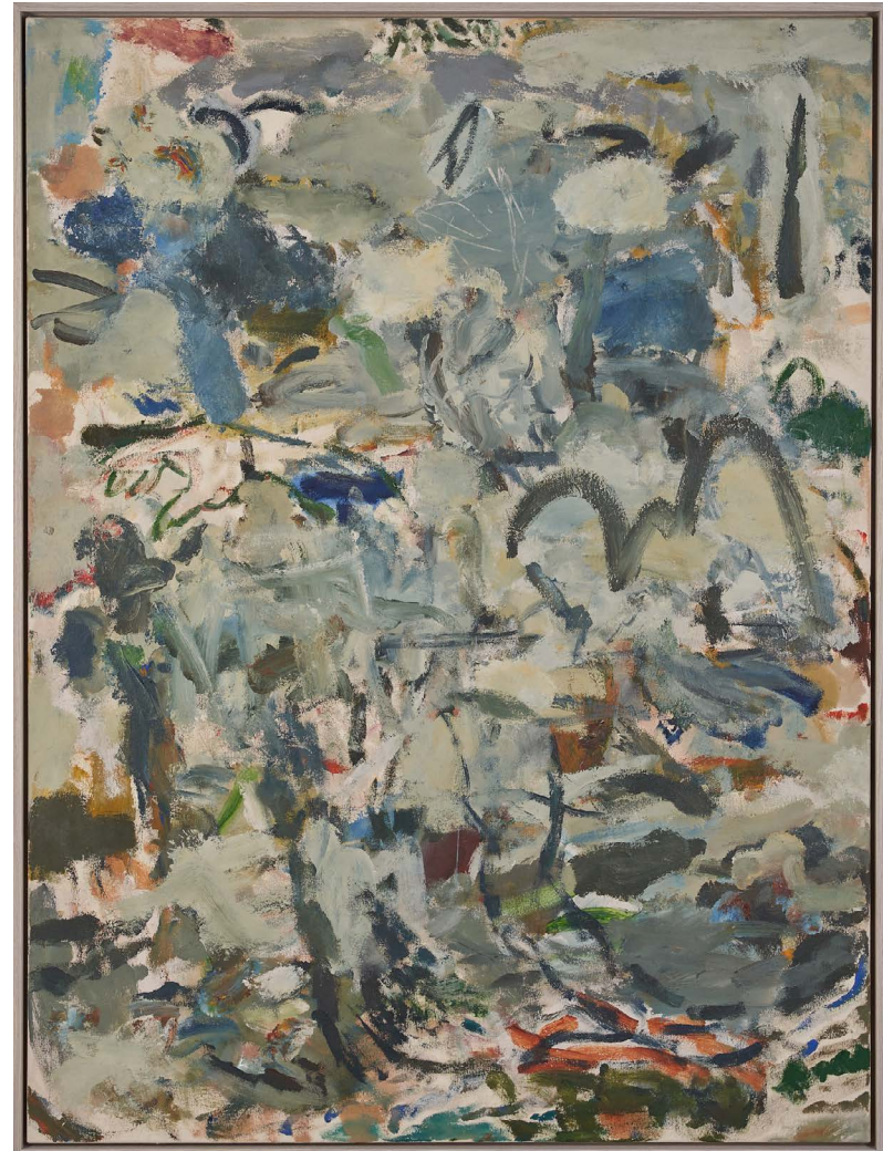
The ghost of things past