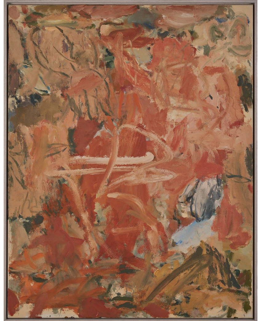
I don't want to take something back