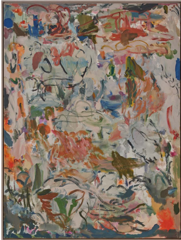
Wherever you go, I will go